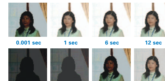
Other brand cameras