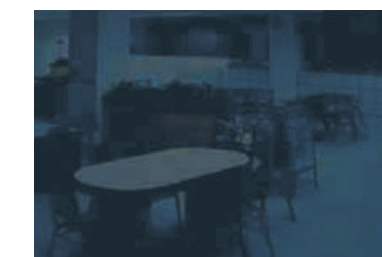
Other Cameras at 0.0035 Lux

With the I-Watch Starlight camera using frame integration technology, we can see color images under 0.0035 lux. We can also extend the effective range of supplementary infrared illumination used to generate "night-time" images. Using frame integration exposures, the effective range of an infrared source can be extended 128 times.