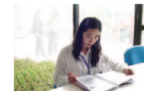
Over exposure Outdoor image washed out.

Natural light range is around 120,000 lux to 0.00035 lux. When the field of view of an indoor camera looking out through glass windows or doors, the indoor illumination may be around 100 lux and outdoor illumination may be as much as 10,000 lux. The contrast is 10,000/100 or 100:1. The human eye is capable of discerning contrasts of 1000:1 so the internal and external views are clear. Normal CCD cameras have a contrast range of approximately 3:1 and depending on the shutter speed used, can over or under expose the image. The I-watch camera has a contrast range of 280:1, this allows the I-Watch Starlight camera to view all of the contrasting subjects within it's field of view.