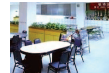
Starlight camera at 0.0035 Lux