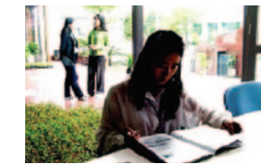
Under exposure Indoor image black out.