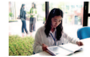
I-Watch Starlight Wide dynamic camera image.

Instant response is another feature provided by the I-Watch Starlight Camera. In an environment with strong lighting contrasts a normal CCTV camera will take much longer to reach optimum exposure. The I-Watch Starlight camera takes only 0.001 sec to align the image.