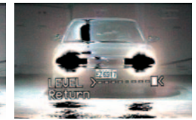
I-Watch Starlight Cameras