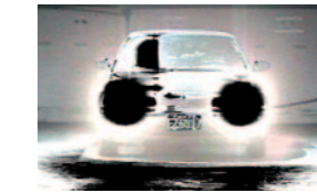
Other White Peak Cameras

Allows the I-Watch Starlight camera to determine exposure index by the brightest positions of the image instead of the method employed by other white peak cameras, i.e. the average value of the whole image.